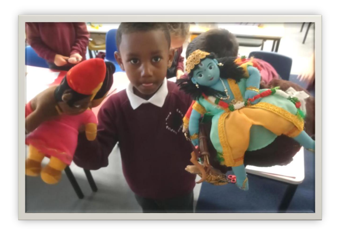
Children re-enacted the Diwali story using puppets